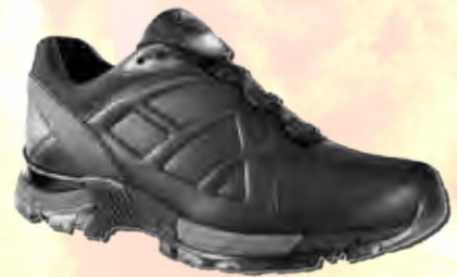
Tactical Low Retail: $149+ tax Our Price: $134 + tax

Running Comfort, 3 Layer GORE-TEX, Micro-Dry Lining, Anti-Slip