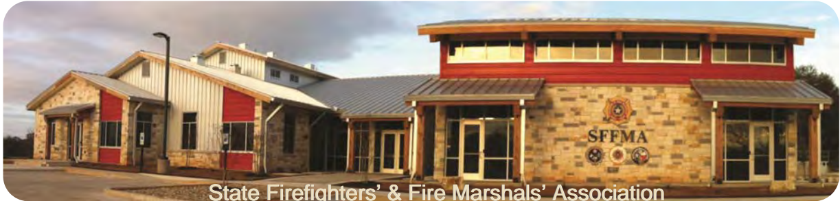
State Firefighters' & Fire Marshals' Association