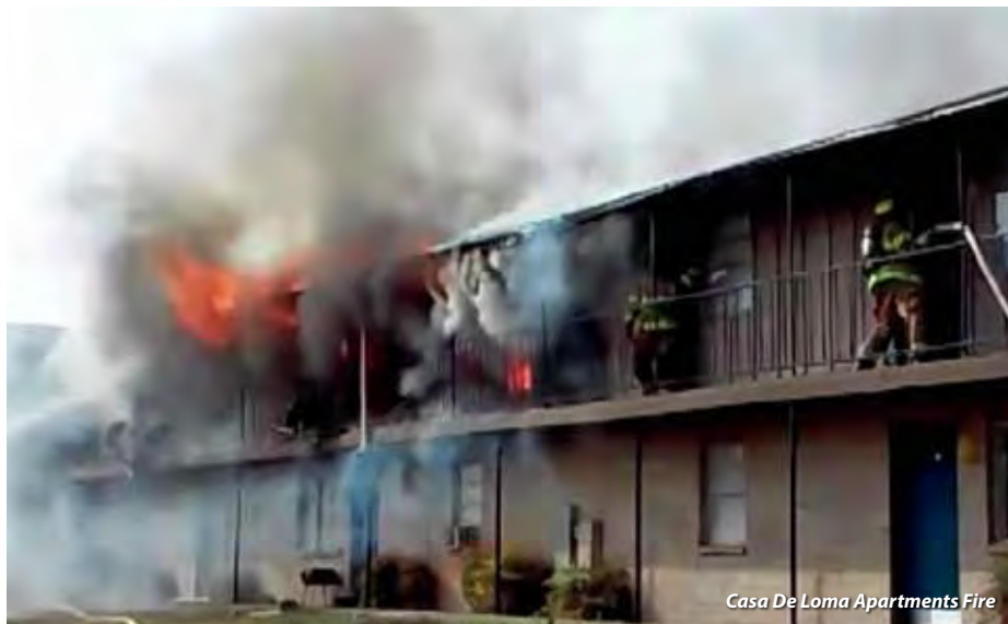
Casa De Loma Apartments Fire

sad moments, happy moments, moments of weakness, moments of compassion, moments of hope—all of these moments are important to all of us. I like to think of them as the building blocks of a complex structure that is never quite complete. And we are the sum of all of these moments. Who knows what this person will accomplish or what they will do for someone else in their lifetime? I took a moment to give them another one; not for recognition and not for thanks (though it doesn't hurt to hear it anyway). Being a firefighter gives you insight into these moments. In a moment you could be pulling a citizen or fallen brother out of a fire, or jumping off a porch to avoid a flashover, or you could be freeing victims from a horrible vehicle accident. This job gives time a whole new meaning of urgency. Who would ever really expect minutes and seconds could be so valuable? Being a firefighter is so much more than a title. A title can't give you selflessness. It can't give you passion for what you do, and it can't give you worth. And that is what makes this job so rewarding—having the opportunity to ensure for those people that there will be more moments. Would I do it again? In a heartbeat, no doubt.