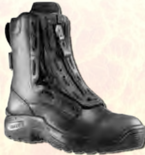
R1 - Station/EMS (NFPA 1999), Steel Toe Retail: $249+ tax Our Price: $224 + tax