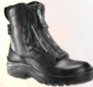
R2 - Station/EMS (NFPA 1999), Steel Toe Retail: $249+ tax Our Price: $224 + tax