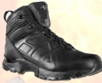
Tactical Mid Retail: $159+ tax Our Price: $143 + tax