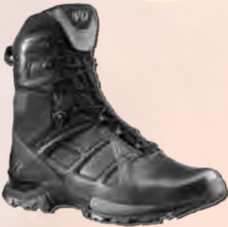
Tactical High Retail: $159+ tax Our Price: $143 + tax