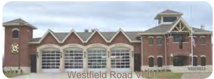
Westfield Road VFD