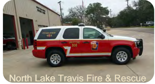
North Lake Travis Fire & Rescue