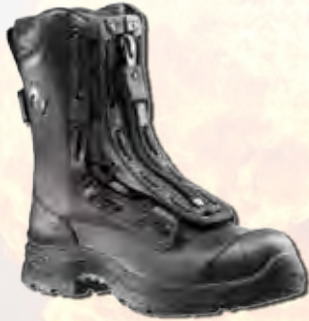
XR1 - Station/EMS/ WL (NFPA 1977, 1999) Dual Certified, Waterproof Leather, Carbon-Composite Toe Retail: $269+ tax Our Price: $242 + tax