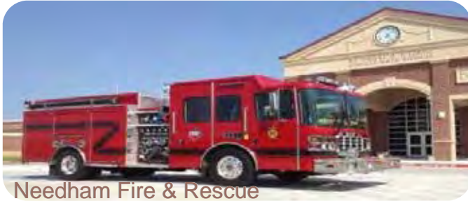
Needham Fire & Rescue

EXCLUSIVE FINANCING PROGRAM FOR SFFMA MEMBERS