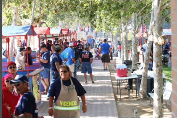
Taste of the Valley, 2016 Conference, McAllen